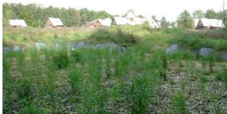
The wetlands at Kitezh and Orion are now operational. The plants are growing and the water flowing out of the reed-filled ponds is clean enough to water the fruit trees.