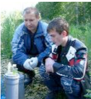
The children participated in the water testing with great interest.