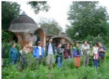
Las Cañadas volunteers