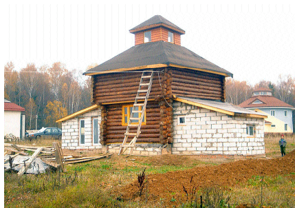
new house at Orion