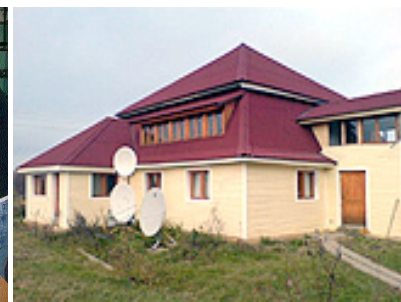
new look Pyramid House at Kitezh